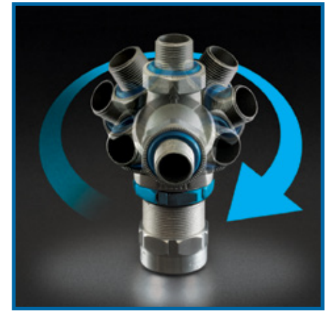
90° to 180° Rotation