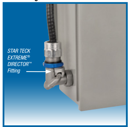
One component that can be used at any angle adds flexibility and requires less space