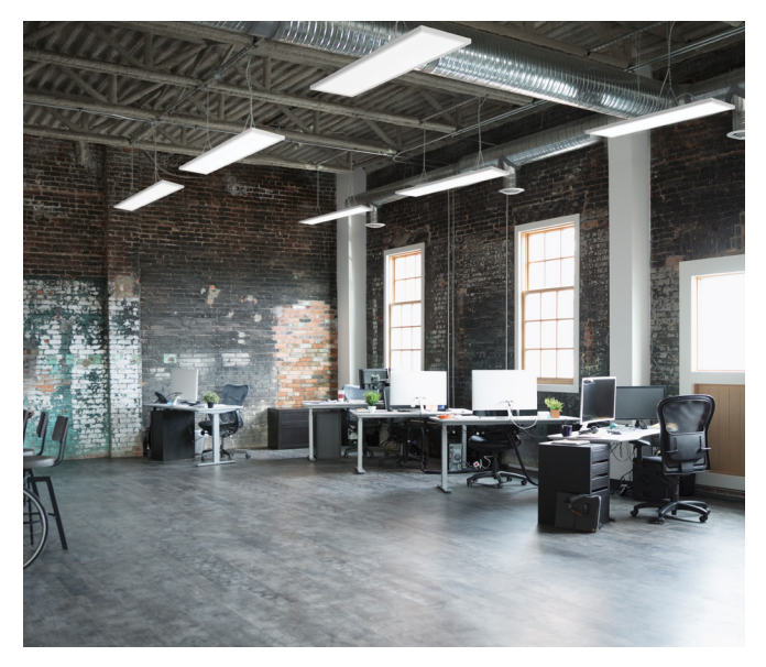
See CPANL specification sheet for full list of compatible accessories.