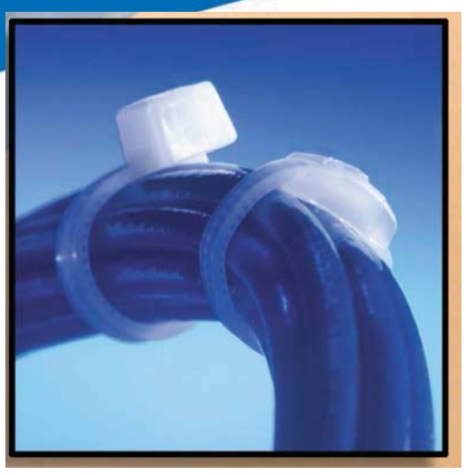
Low profile contoured head compared with the profile of the traditional T&B® Cable Tie.