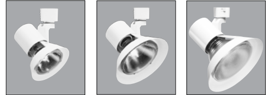
Front Load Lamping

Specifications subject to change without notice.