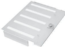
A0285986 Locking Cover for 250-pair Mount

The Distribution Ring is used in wall mount installations providing a cross-connect channel for jumper wires, patch cords and cables. The Distribution Ring interlocks with the QMBIX12E or QMBIX10A mounts, providing proper spacing and alignment.