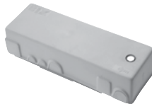
A0277853 QMBIX31A 50-pair Mount with Locking Cover

Two sizes are available to suit either the QMBIX12E 300-pair mount or the QMBIX10A 250-pair mount. The two locking covers used in wall or frame-mounted installations are molded with translucent plastic allowing visual inspection. Also available are two covers used exclusively in stand-alone QMBIX10A 250-pair mount installations: one locking, the other non-locking—both have four cable entries, one at each corner.