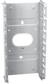
A0340836 QMBIX12E BIX Mount, 300-pair