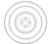
Round Small Grommet 0.335" to 0.395"