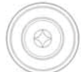
Round Medium Grommet 0.395" to 0.495"