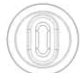
Oval Large Grommet 0.451" x 0.225" to 0.585" x 0.282"