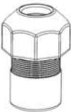
Solvent Cement Body