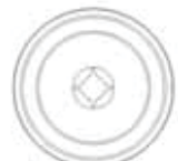
Round Large Grommet 0.495" to 0.575"