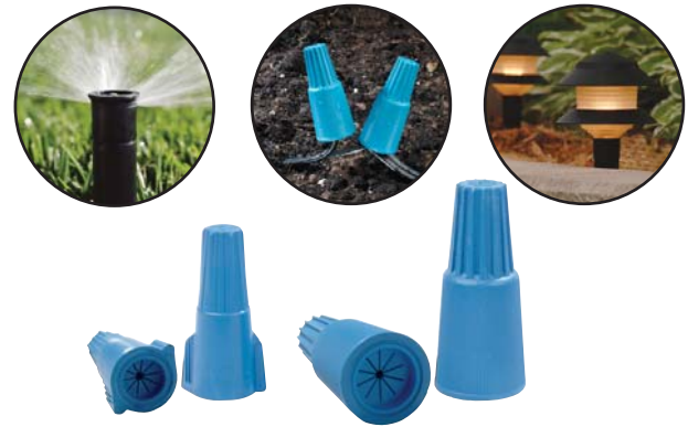
WeatherProof™ Wire Connectors