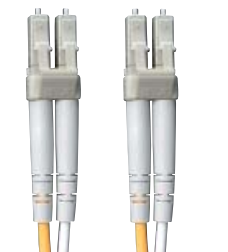
LC Duplex to LC Duplex MM