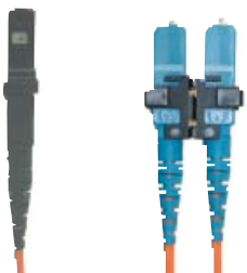
MT-RJ Duplex to SC Duplex MM