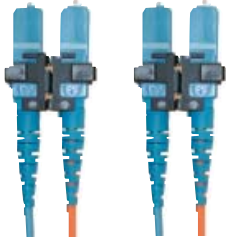
SC Duplex to SC Duplex MM