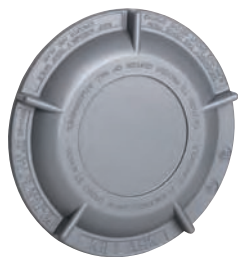
GRM-BC Blank Cover