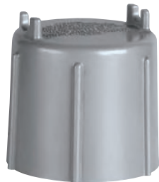
4GOU Dome Cover