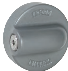
GECEY Sealing Cover