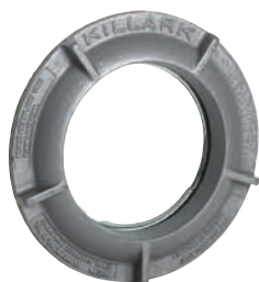
GL-375 Lens Cover