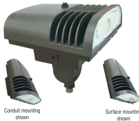
Conduit mounting shown