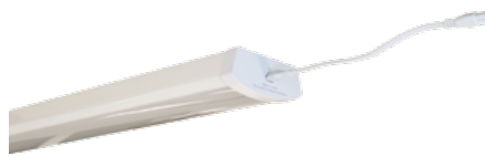
FIXTURE WITH 12" LINKABLE CABLE CONNECTOR