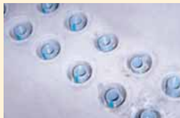
After concrete pour