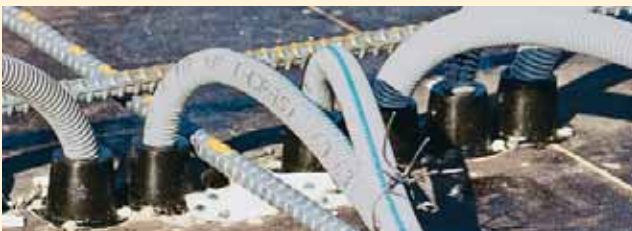
Before concrete pour