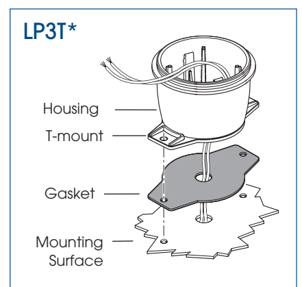
*LP3T-120 & 240VAC shown