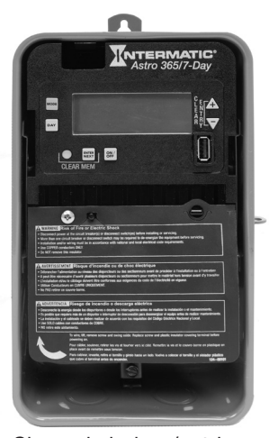
Shown in indoor/outdoor lockable metal enclosure

The time switch features an LCD and panel-mounted control buttons to set, review, and monitor the time switch functions, including setting date and time, schedule creation, enabling or disabling Daylight Saving Time (DST) and configuring DST switchover dates. Follow these instructions to complete the installation and programming of the ET2805 time switch.