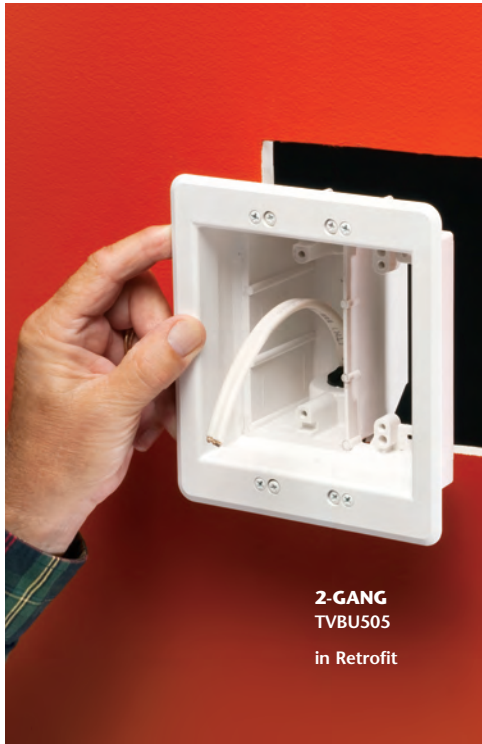
2-GANG TVBU505 in Retrofit