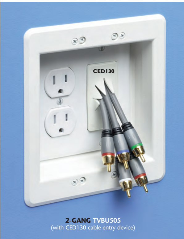
2-GANG TVBU505 (with CED130 cable entry device)