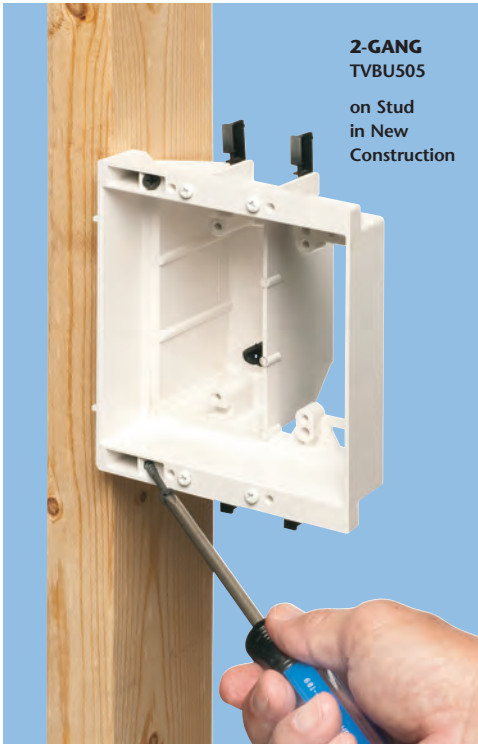
2-GANG TVBU505 on Stud in New Construction