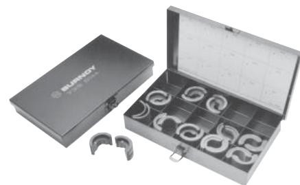
U die case Catalog Number: PT29291 , holds up to 15 U or U-Wide die sets.