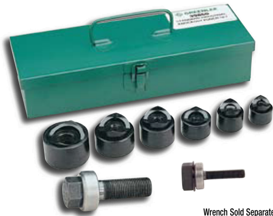
Wrench Sold Separately