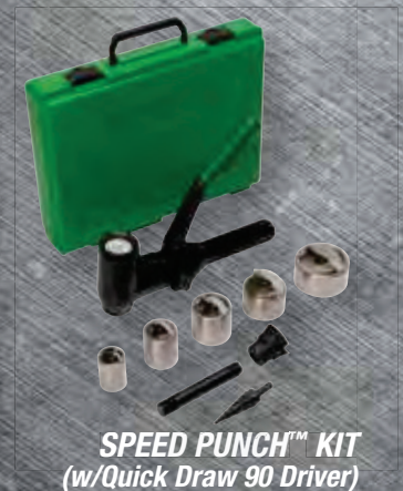
SPEED PUNCH™ KIT (w/Quick Draw 90 Driver)