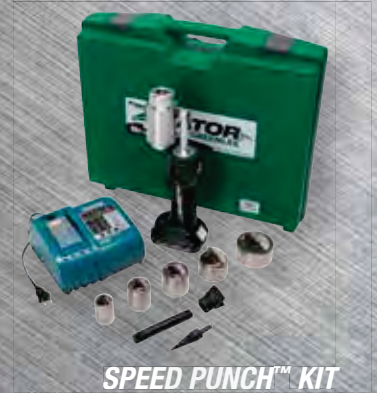
SPEED PUNCH™ KIT (w/LS50 Driver)

* Case accommodates Quick Draw or Quick Draw 90 Drivers - sold separately.