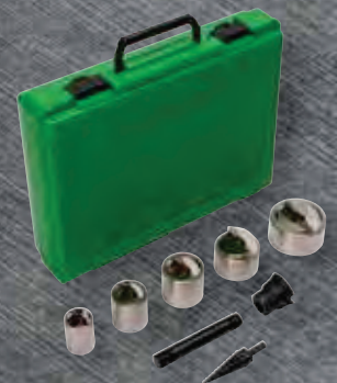
SPEED PUNCH™ KIT (without driver)*

Look for SPEED PUNCH™ products and "Try Me" display at supporting Greenlee distributors.