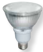
MOL = 5 in. (127 mm) Dia. = 3 1/4 in. (95 mm)