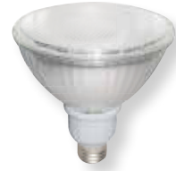
MOL = 5 1/2 in. (139 mm) Dia. = 4 13/16 in. (122 mm)