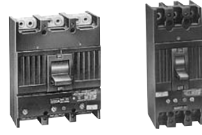
TJJ, TJK, THJK TFJ, TFK, THFK