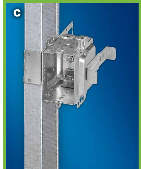
C Final installation with no screws required