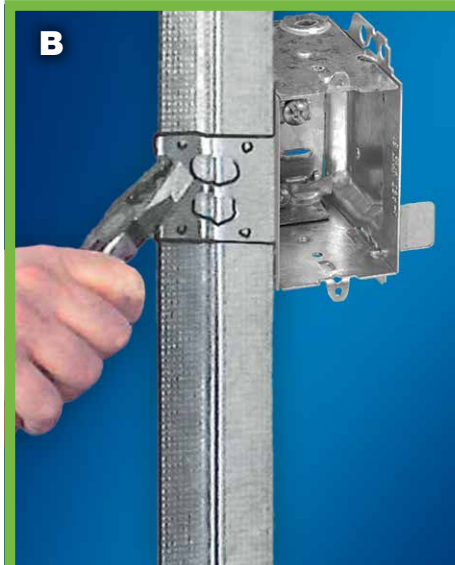
B Crimp bracket and stud with pliers