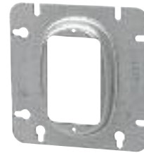
CI72-C-10 CI72-C-13 CI72-C-14