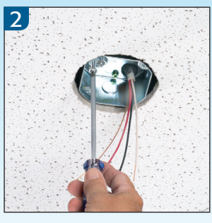
2. Pull cable through installed NM cable connector and remove captive screws for fan/fixture bracket installation.