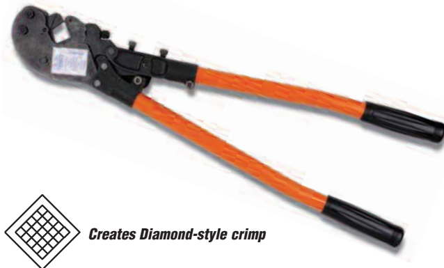
Creates Diamond-style crimp