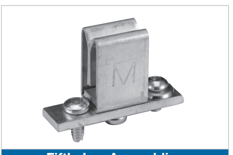
Fifth Jaw Assemblies