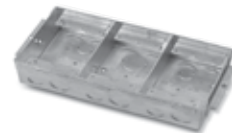
63-W Wood Floor