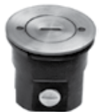
672 Wood Floor