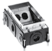
664-CI Two Pour Concrete