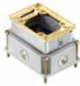
840, 640 Series — Flush Multiple Service

The aesthetic and technical needs of today's buildings are as diverse as the equipment that fills them. Small wonder, then, that floor boxes can continue to solve the needs of today and the future as they did in the early 1900's when they were invented.