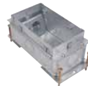
664-S Slab on Grade Steel Deck with Concrete Pour