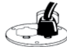
P60 Series — Power Application

All power, communications and data devices are hidden below the finished floor level.