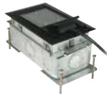
664-SC Slab on Grade Steel Deck with Concrete Pour