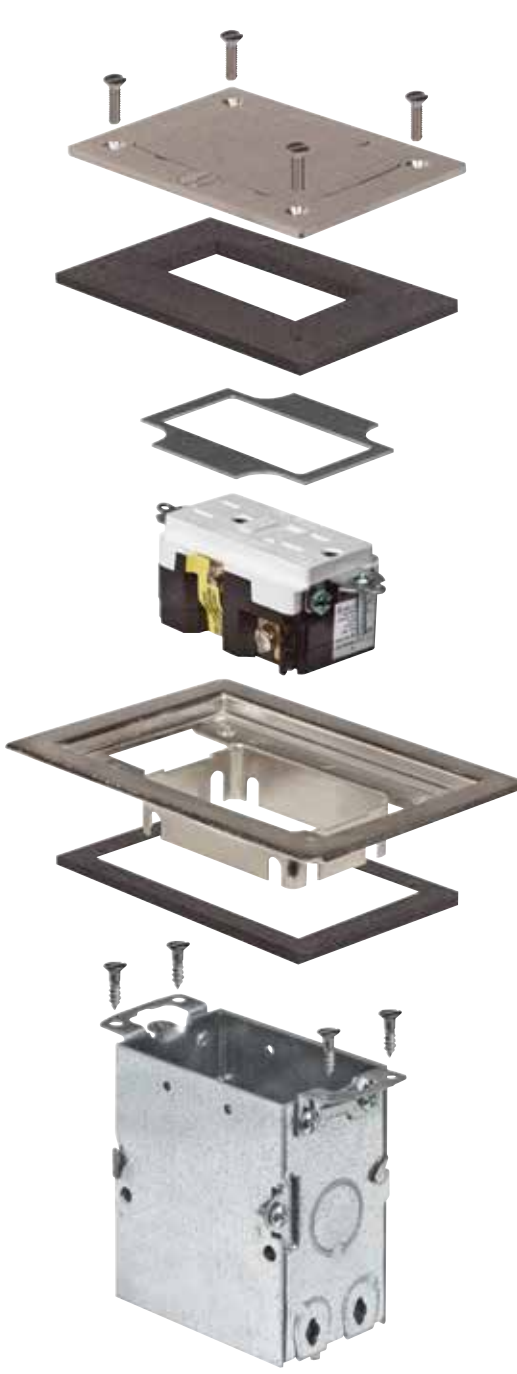
71W Series (complete kit)

Floor Boxes Designed for the Following Applications: