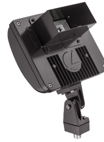
FV - Full visor W= 5-1/4" (13.3 cm) H= 2-1/2" (6.3 cm) D= 3" (7.6 cm)