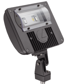
VG - Vandal guard W= 6-1/2" (16.5 cm) H= 4" (10.1 cm)