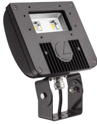
YKC62 - Yoke with 50 cord H= 4-1/4" (10.7 cm) D= 2-1/4" (5.7 cm)