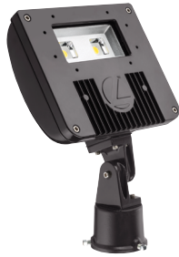
IS - Integral slipfitter H= 2-1/2" (6.3 cm) ID= 2-3/8" (6.0 cm) OD= 3-1/2" (8.8 cm)