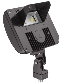
UBV - Upper/bottom visor W= 5-1/4" (13.3 cm) H= 2-1/2" (6.3 cm) D= 3" (7.6 cm)