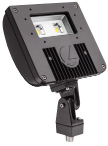
THK - Knuckle with 1/2" NPS threaded pipe