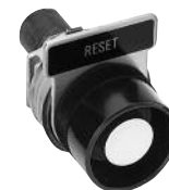
Reset Kit for Starter Enclosure