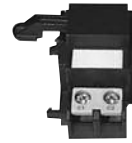
Remote Electrical Reset