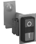
Start/Stop Push Button