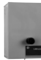
Enclosure with optional CLXR11 reset kit