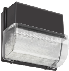
VG - Vandal guard