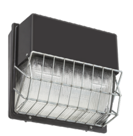
WG - Wire guard