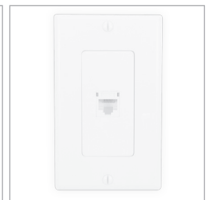
Faceplate and ports sold separately