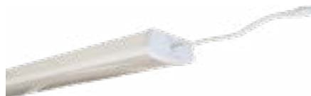
FIXTURE WITH 12" LINKABLE CABLE CONNECTOR