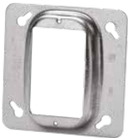
CI52-C-10 to CI-52-C-62