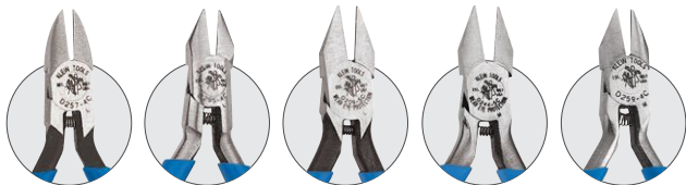
Tapered Nose Standard Jaw Tapered Nose Mini Jaw Pointed Nose Standard Jaw Pointed Nose Narrow Jaw Pointed Nose Extra Narrow Jaw