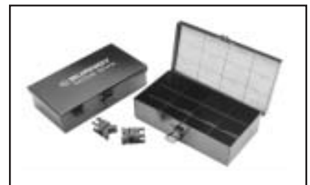
W die case Part# PT4946 , holds up to 12 dies