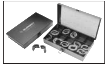
U die case Part# PT29291 , holds up to 15 dies