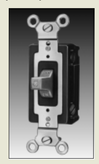
The GE 5935 Series does not offer pilot light or locator light versions.