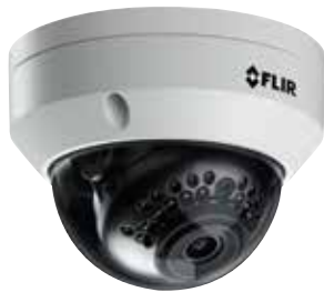
N253V8 4K Ultra HD Fixed Vandal Dome

The FLIR 4K Ultra HD Fixed Vandal Dome IP camera offers exceptional performance with 4K Ultra HD resolution, providing excellent image clarity and an incredible level of detail in recordings. H.265 delivers improved compression efficiency for significant hard drive space savings. The camera also supports edge storage for recording flexibility.