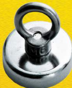
Part# RV050 - 50 lbs 2 Pack