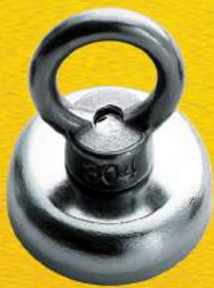
Part# RV025 - 25 lbs 3 Pack