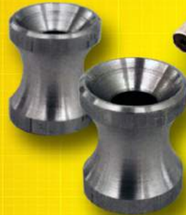
Hourglass Dowels (smooth) Part# 78050 – Up to 500MCM Part# 78060 – Up to 750MCM