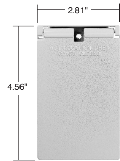
Vertical 1 Self-Closing Lid