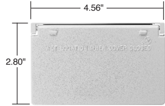
Horizontal 1 Self-Closing Lid