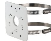
PFA152-E Pole Mount