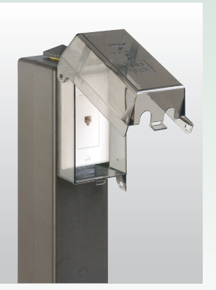
Or add the Low Voltage Separator and run Low Voltage on one side and Power on the other!

Install one or two GFCI Wiring Devices with