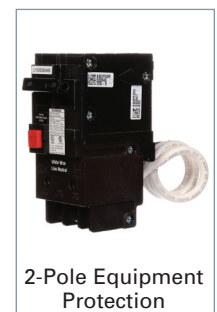
2-Pole Equipment Protection