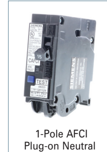
1-Pole AFCI Plug-on Neutral