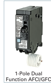
1-Pole Dual Function AFCI/GFC