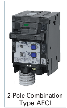
2-Pole Combination Type AFCI