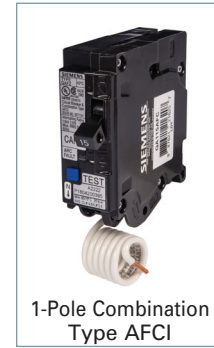
1-Pole Combination Type AFCI

■ Built to order. Allow 8 -10 weeks for delivery.