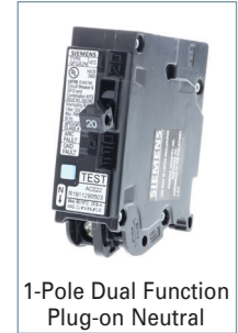
1-Pole Dual Function Plug-on Neutral