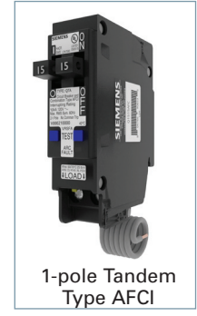
1-pole Tandem Type AFCI