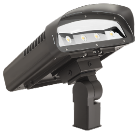
OLWX2TS Slipfitter for OLWX2

Standard size tenon is 2 1/8". The slip fitter has a range of 2" to 2 3/8".