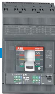
XT2 - 125A