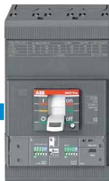
XT4 - 250A