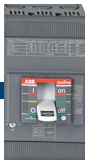
XT1 - 125A