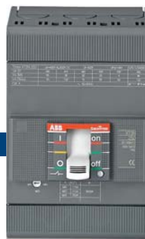
XT3 - 225A