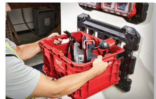
Stack or Hang