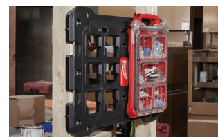
Wall & Floor Mounting