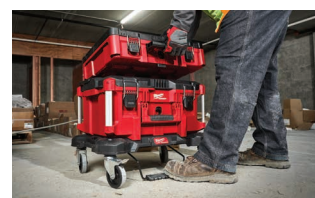
QUICKSTOP™ Loading Lever