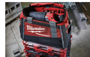
Spacious Storage Compartment