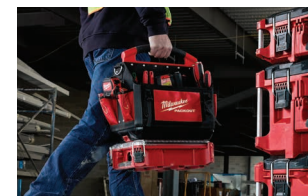
Optimized Storage Capacity