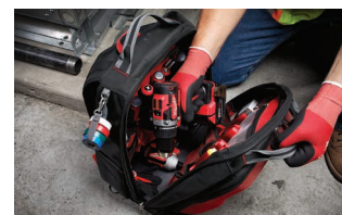
Optimized Storage Capacity