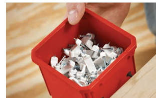
Removable & Mountable Bins