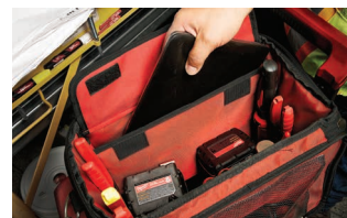
Optimized Storage Capacity