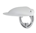
PFA200W Sun/Rain Shield