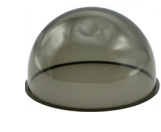
PC-H49-D90 Polycarbonate Smoke Tinted Bubble