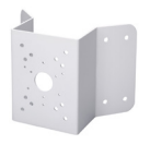
PFA151 Corner Mount