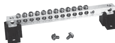
TGK12 with TGKIS