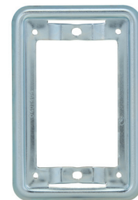
Adapter plate for mounting WLRS/WLRD covers to flush device boxes