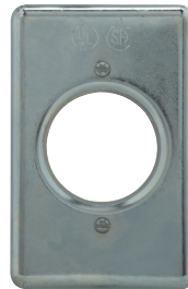
For flush plug receptacle requiring 1 5 / 8 " opening diameter