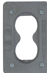
For standard and 3-pole, 2-wire grounding type duplex convenience receptacles; gasket included